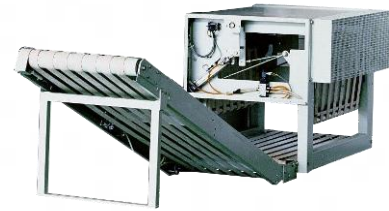
Photo shown stacker separately